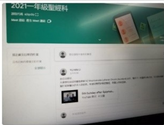
給全校的google classroom 上午10:17